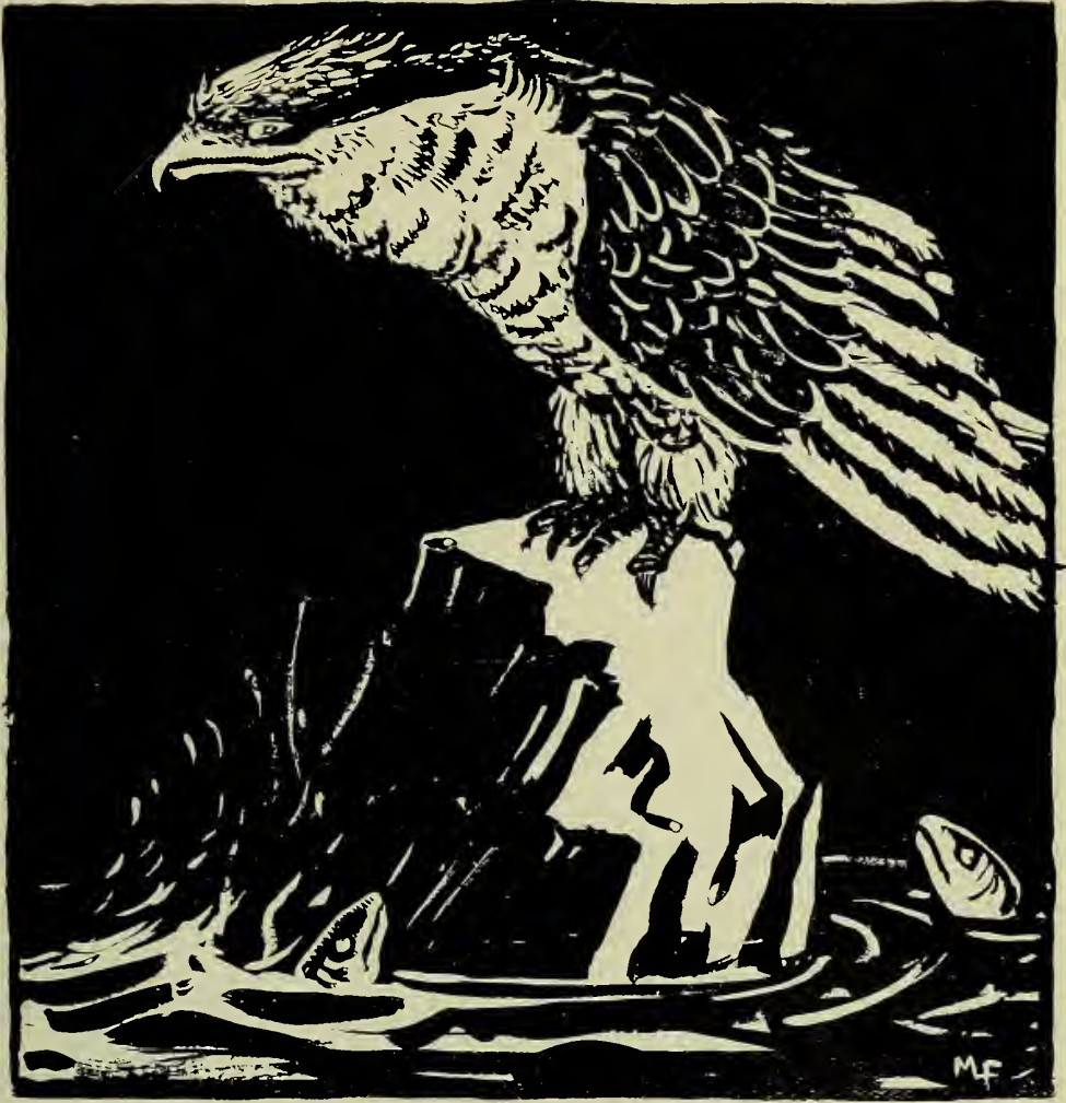
AND WITH HIS MAGIC POWER HE CHANGED HER INTO A FISH-HAWK AND SENT HER OUT TO THE OCEAN